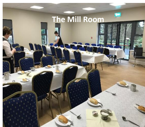
The Mill Room