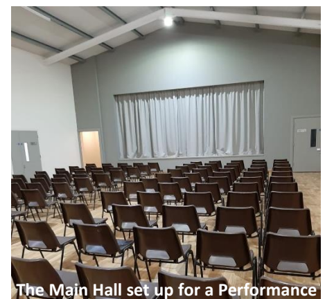
The Main Hall set up for a Performance