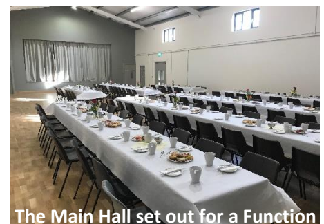
The Main Hall set out for a Function