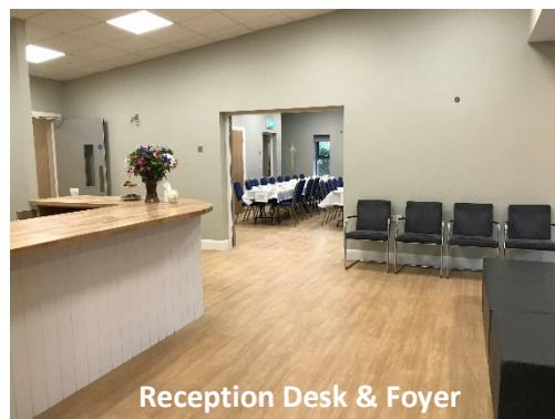
Reception Desk & Foyer